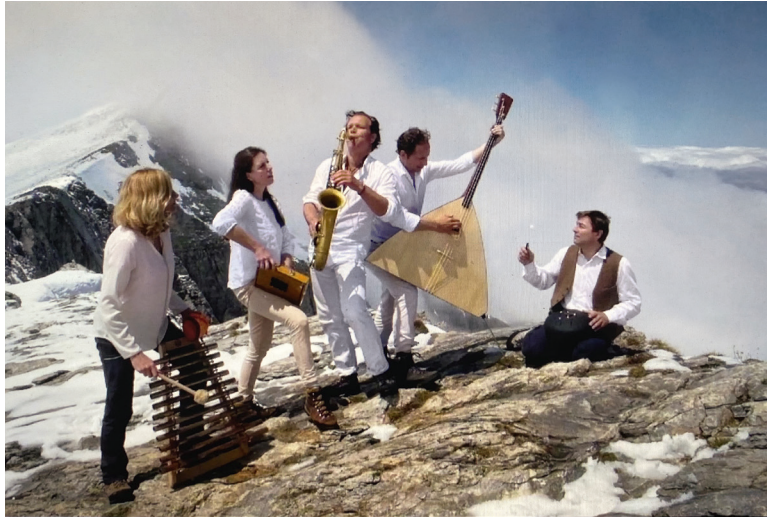
OLYMPUS [2,918 HM] Greece