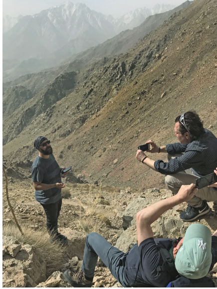
SHIR KUH [4,055 HM] Iran